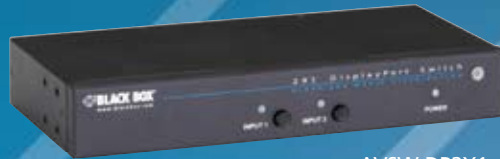
AVSW-DP2X1 (front view)