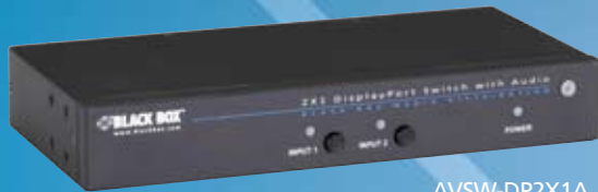
AVSW-DP2X1A (front view)