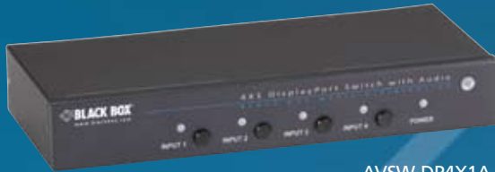
AVSW-DP4X1A (front view)