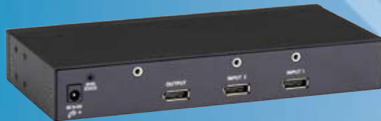
AVSW-DP2X1A (back view)

The diagram below shows the AVSW-DP4X1A connections.