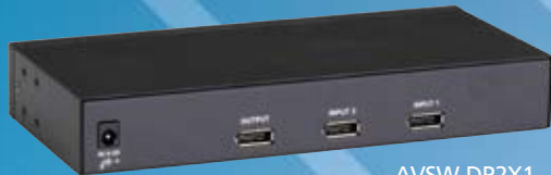
AVSW-DP2X1 (back view)