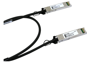
Figure 1. Cable (non-binding illustration)