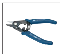
Jacket remover JR-M03