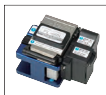
Table-top cleaver FC-6 / FC-6R series