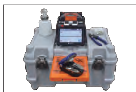
Carrying case with worktable CC-72