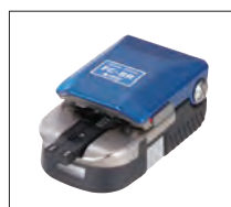
Handy cleaver FC-8R series