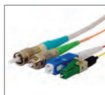
Compatible with Lynx-CustomFit™ Splice-on Connector