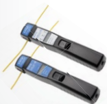
Live Fiber Identifier/ Tone Generator LFD-300B/TG-300B